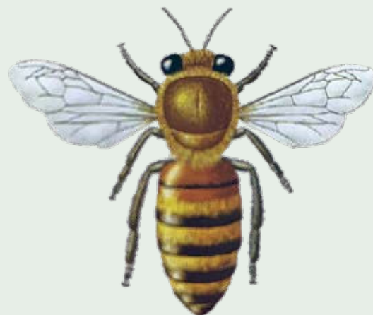
Italian Honeybee A. m. ligustica

We are excited about the privilege and responsibility of hosting bees on our land and look forward to the time when we can share their bounty with our members and guests.