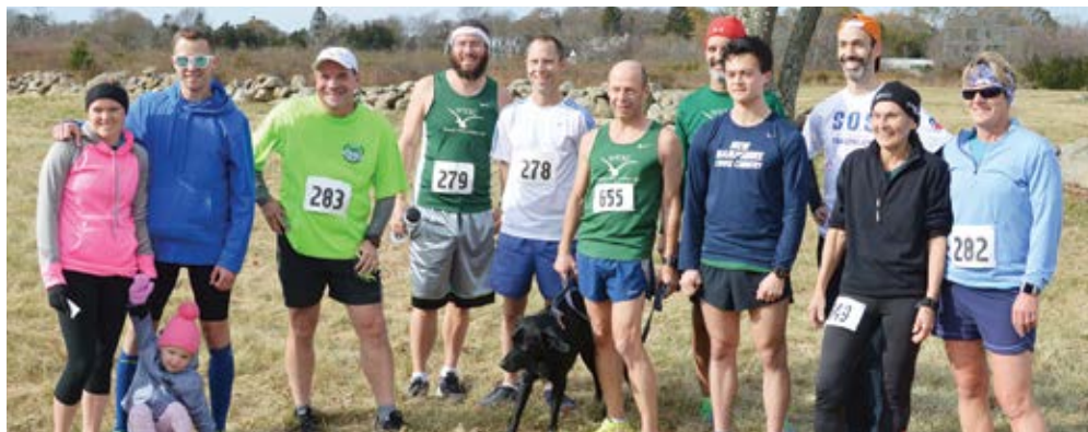
2019 Setting the Pace for Conservation 5K Race Leaders