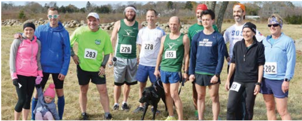
2019 Setting the Pace for Conservation 5K Race Leaders