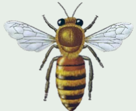
Italian Honeybee A. m. ligustica

We are excited about the privilege and responsibility of hosting bees on our land and look forward to the time when we can share their bounty with our members and guests.