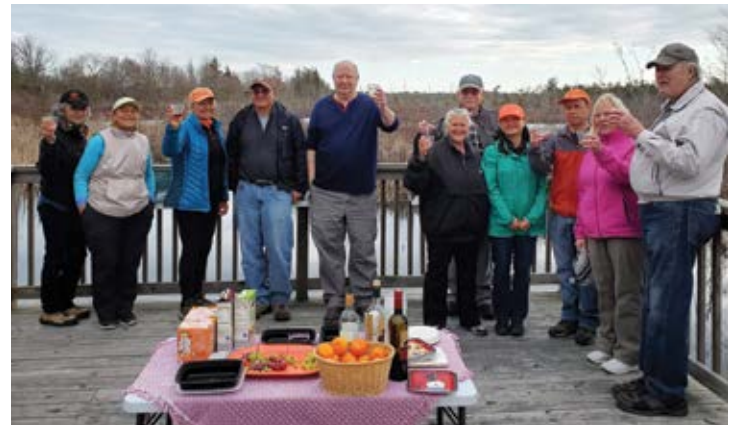
2021 Earth Day Hike Crandall Preserve