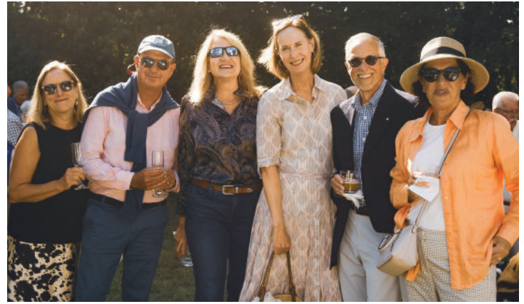
2025 Farm Dinner