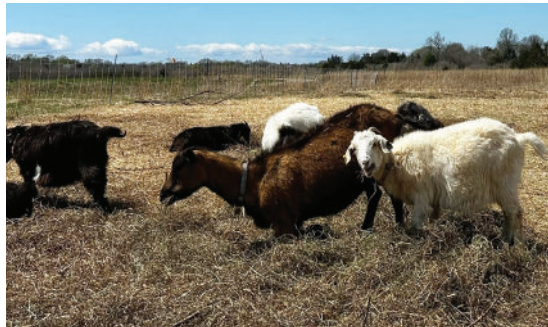
Goats from Röm Land and Livestock spent the winter clearing invasive plants at Avondale Farm Preserve.

To be a steward is to recognize that we are temporary guardians of a timeless gift. Whether clearing invasive species, blazing trails, leading a school group, or simply walking a dog on a protected path (remember to keep the trails clear for the next visitor!), you are part of a vital legacy. Together, we ensure that the natural beauty of Westerly remains vibrant, resilient, and open to all—today, and for every generation to follow.