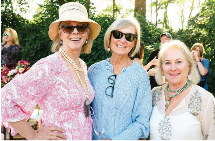
2025 Farm Dinner